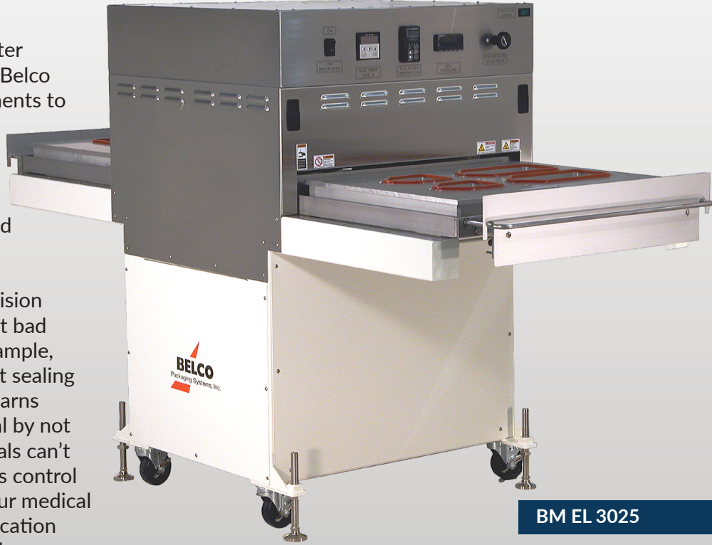
BM EL 3025

Take a closer look... you'll see how our precision controls and built-in safety features prevent bad seals and compromised production. For example, the temperature process alarm ensures that sealing only occurs at the proper temperature. It warns the operator of any temperature differential by not allowing the machine to be cycled. Poor seals can't happen inadvertently. Quite simply, process control is the hallmark of our design philosophy. Our medical tray sealers offer you four levels of sophistication with one unwavering commitment to excellence.