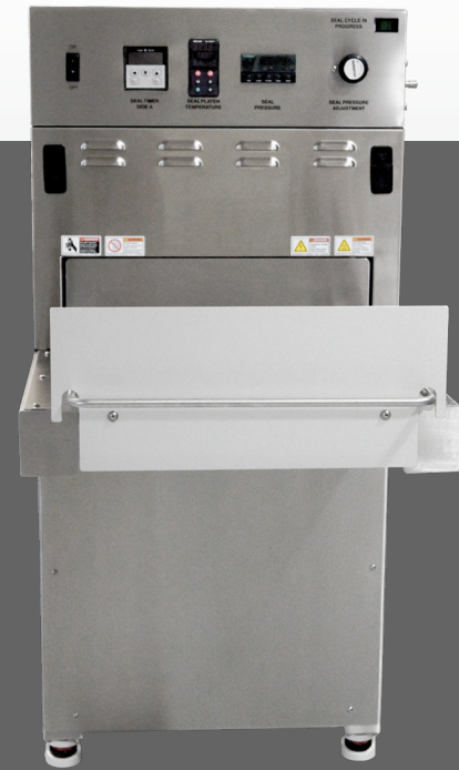
BM EL 2020

Belco's EL Series of Medical Tray Sealers offer great flexibility by providing independent seal time controls for front and rear shuttles. Temperature and Pressure seal parameter settings can be visually confirmed by viewing the convenient eye level mounted digital displays, providing a higher level of process control. Each operator may seal different packages, such as an inner and outer tray, for increased productivity.